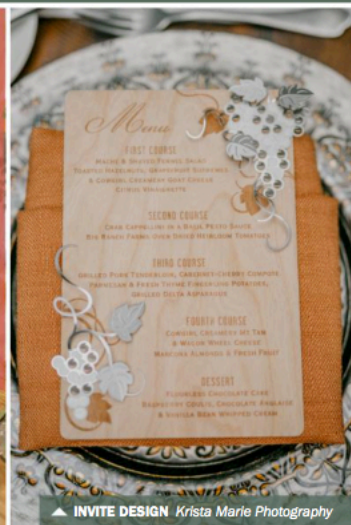
▲ INVITE DESIGN