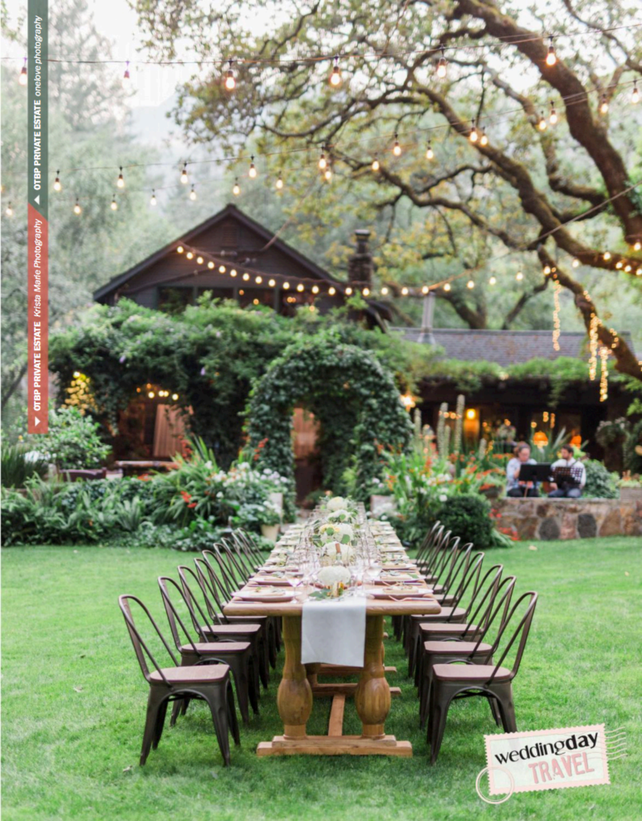
OTBP PRIVATE ESTATE

Picture yourself sipping cocktails under the stars at a meticulously gardened, private residence adorned with palm trees or eating an extravagant, five-course dinner in your very own romantic wine cave. These are just a few of the unique options Off the Beaten Path has to offer for your welcome party, rehearsal dinner, reception and farewell brunch! Off the Beaten Path will secure the perfect, trendy venue for your dream wedding. Many of their venues are private estates that are exclusive for OTBP brides. They also work with luxury venue management firm Distinct Locations to offer even more options. Can you say 'chic'?