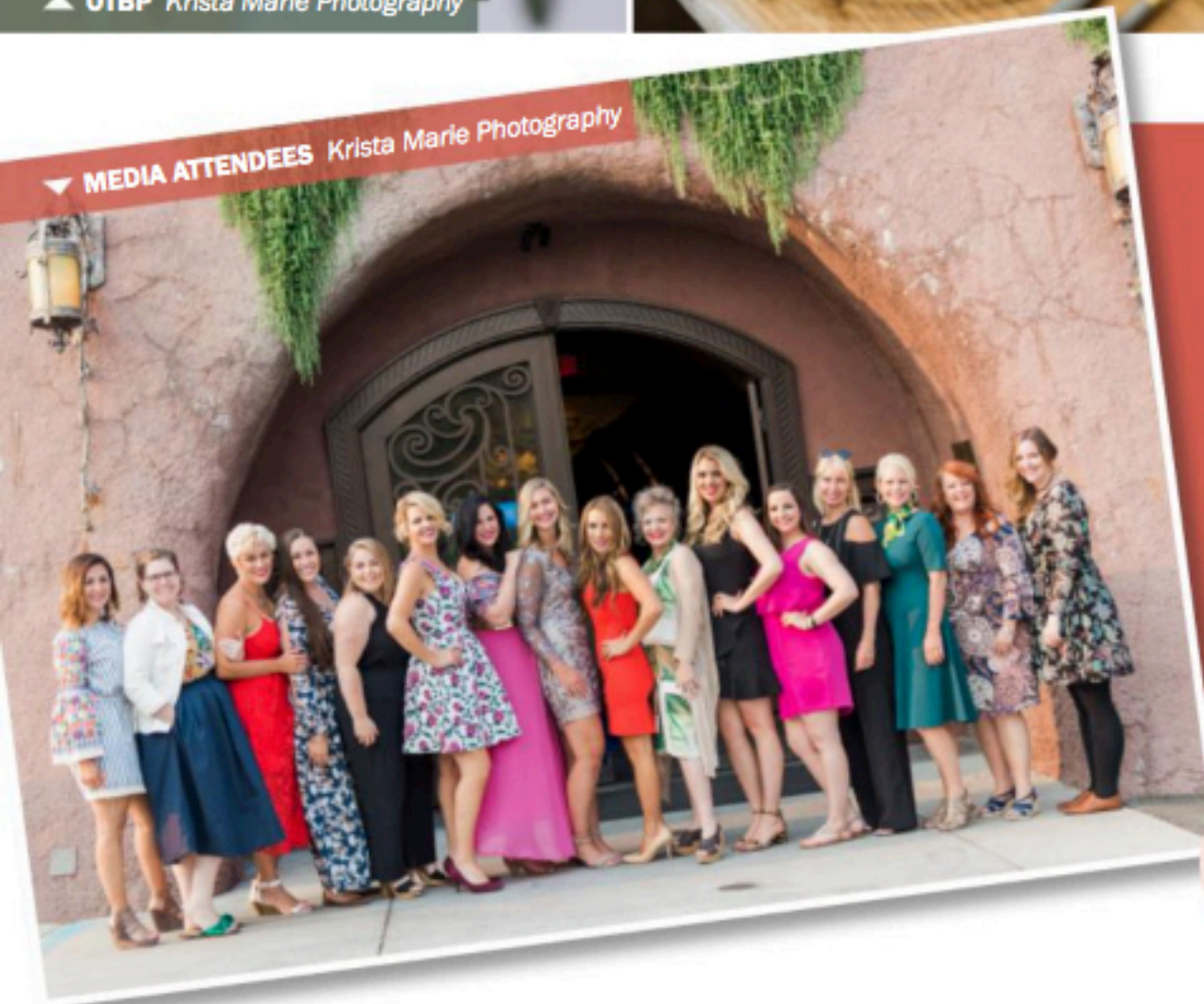
▼ MEDIA ATTENDEES

An Off the Beaten Path wedding is all about the experience. If you're Interested In a destination wedding In California Wine Country, or for more Information regarding their services, properties and amenities, email hi@offthebeatenpathwinecountry.com or visit offthebeatenpathweddings.com .