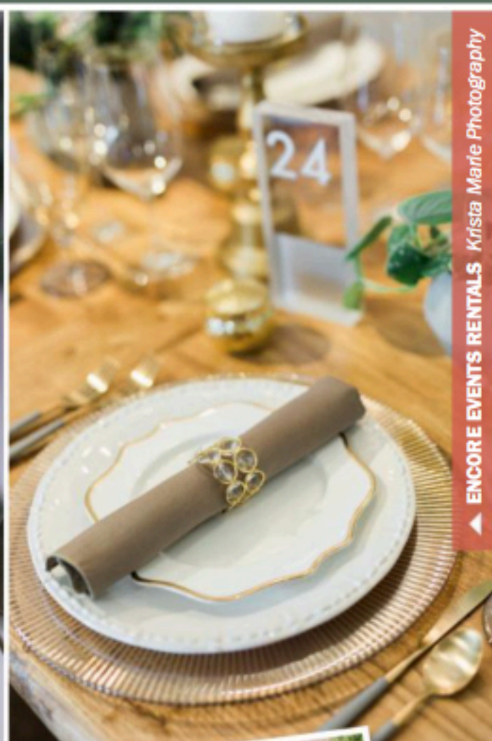
▲ ENCORE EVENTS RENTALS