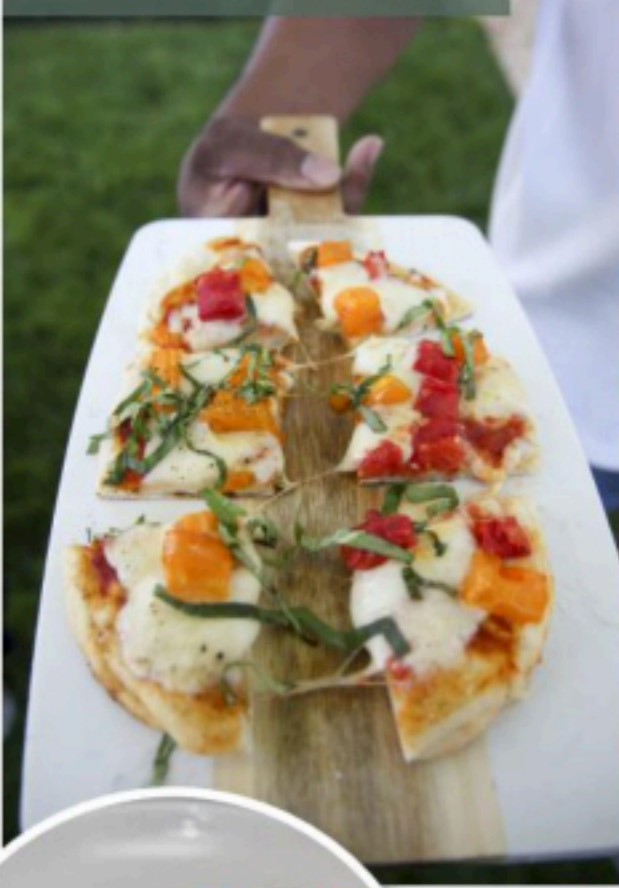
▼ OTBP CATERING Boudoir by Chee

A celebration in nature wouldn't be complete without a farm-to-table feast. All catering uses locally sourced products from respected names such as Beffa Springs Ranch and Cowgirl Creamery. You can enjoy assorted flatbreads, pear/peach mixed-greens salads, crab capellini, grilled pork tenderloin and flourless chocolate cake with raspberry coulis, to name a few. This delicious and visually appealing cuisine will impress guests at relaxed welcome parties or elegant receptions. Of course, you can't have a California Wine Country wedding without wine! Sip on selections from Petroni Vineyards, K Squared Cellars and Silver Trident Winery, all expertly paired with each meal. Expecting guests that aren't wine people (gasp!)? OTBP can provide seasonally-inspired beverages and personalized cocktails from distillers such as Alley 6 that are just as pretty as they are tasty!