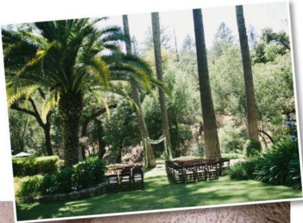
PETRONI VINEYARDS, DISTINCT LOCATIONS

How are you supposed to tour venues, attend tastings and coordinate with your florist all from thousands of miles away? Enter an all-inclusive event planner that will coordinate everything (yes, everything!) necessary for your wine country nuptials. With an expertise in planning celebrations in nature, Off the Beaten Path (OTBP) specializes in eco-friendly, quality driven and sustainable practices. All of this means a stress-free planning experience that allows you to focus on the most important thing—celebrating your love.