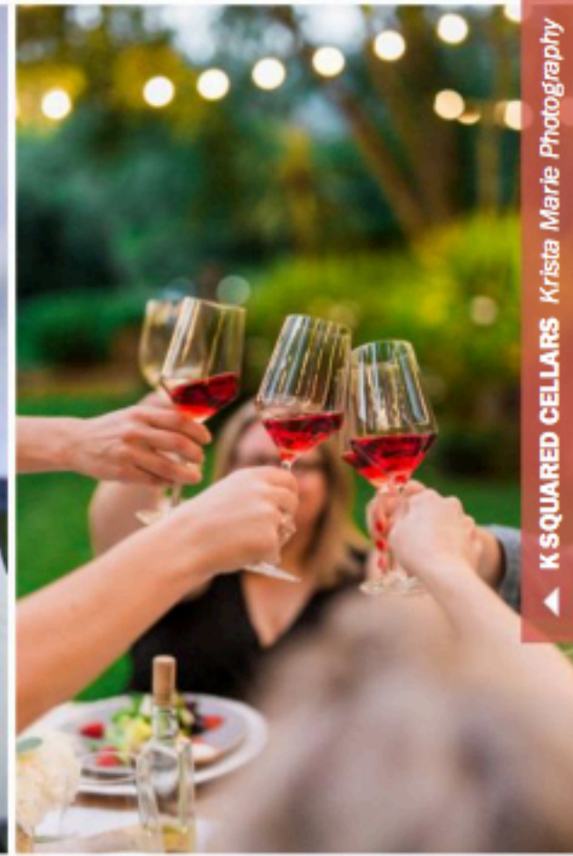
▲ K SQUARED CELLARS