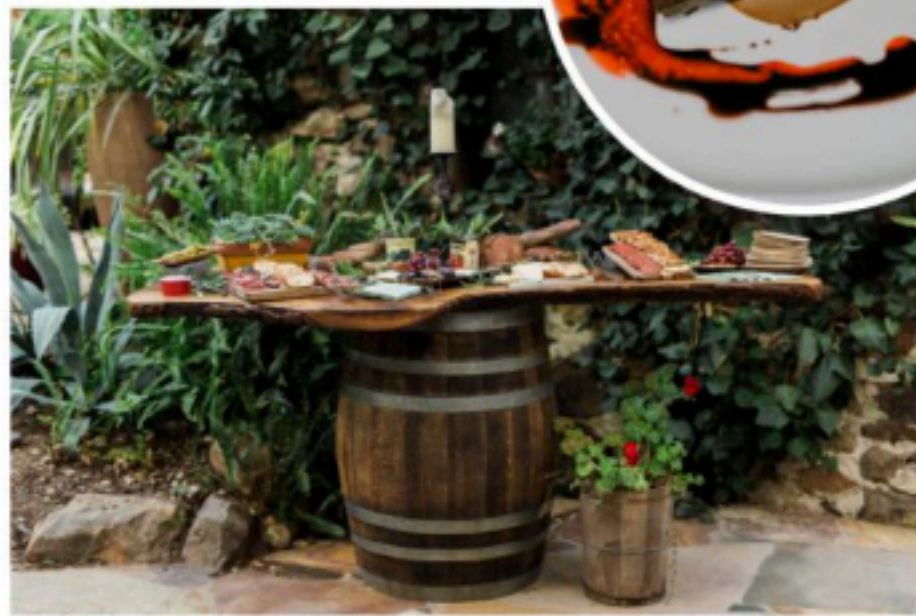
▼ OTBP CATERING ▲